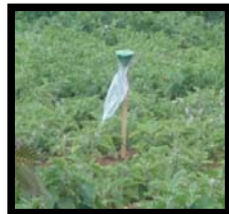
1.b) Sleeve trap