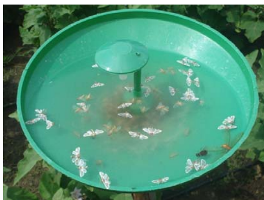
Fig. 3. Moth catches in Wota-T trap